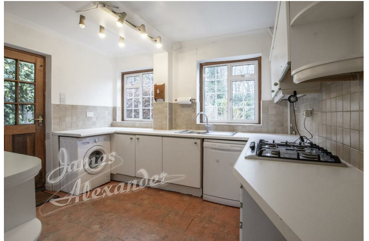
Kitchen 11'1" x 9'2" (3.4 x 2.8)